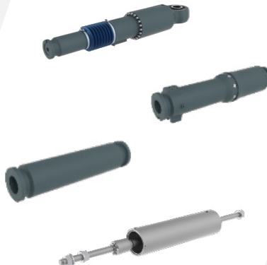
Draw / Buff Gear &amp; Centering Device